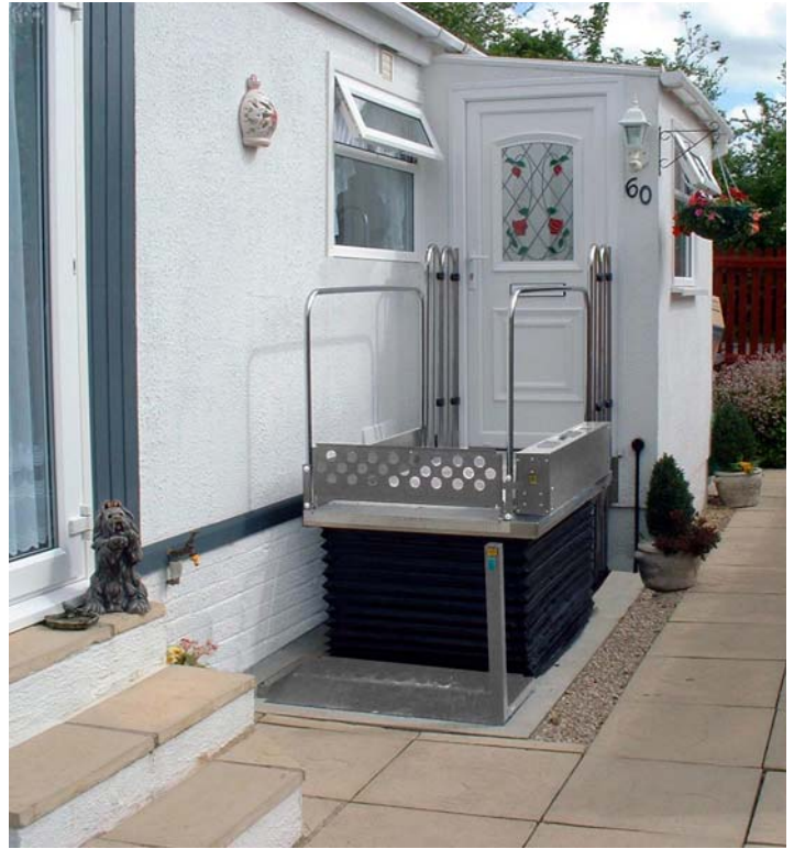
TSL 1000 with double step bridging unit in line with door way