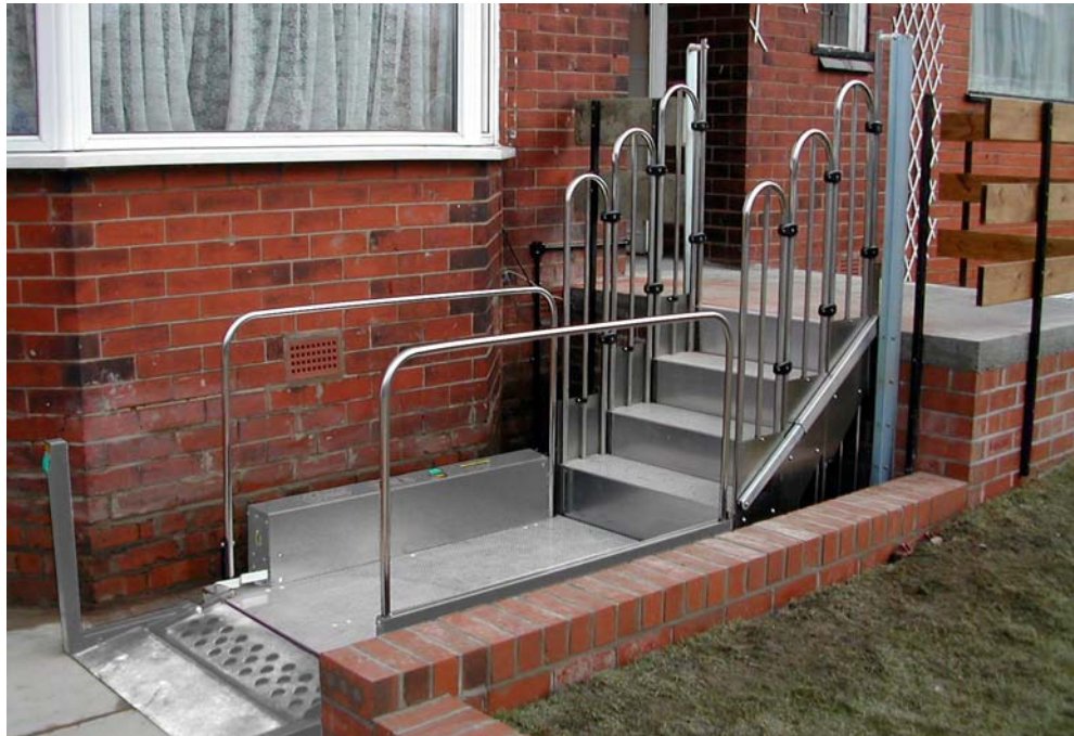
TSL 1000 with triple step bridging unit and upper level landing