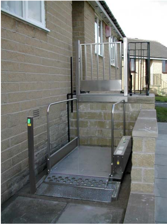
TSL 1000 with upper level gate

The Terry STEPLIFT 1000 is the ideal solution to wheelchair access problems in domestic situations