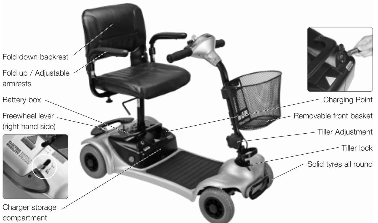
Photo shows UltraLite 480 model scooter. The UltraLite 380 is a 3 wheel version. See the specification for differences.